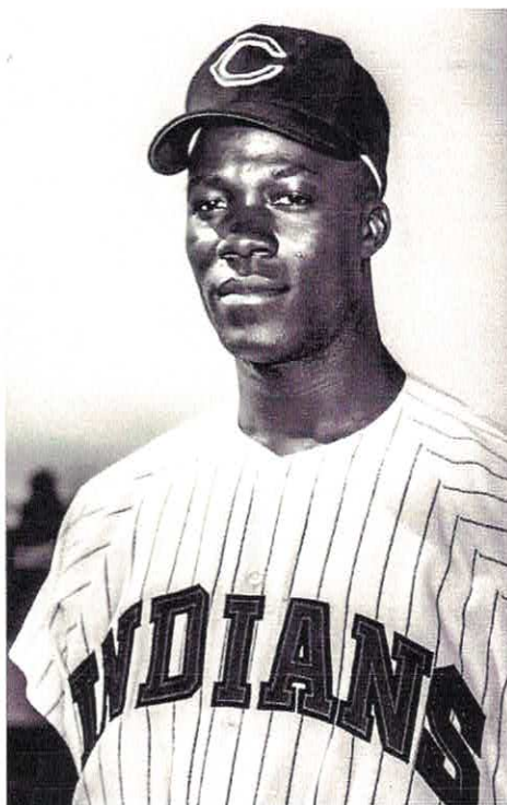
In 1958, Cleveland's Jim "Mudcat" Grant (pictured) and Gary Bell may have been the first Black and white teammates to room together in the big leagues. For many years, teams would employ an even number of Black players to create roommate pairings.